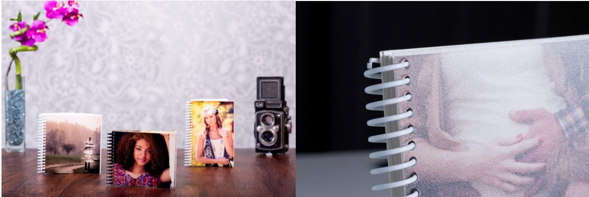
Spiral Bound, Printed on Fuji Luster paper