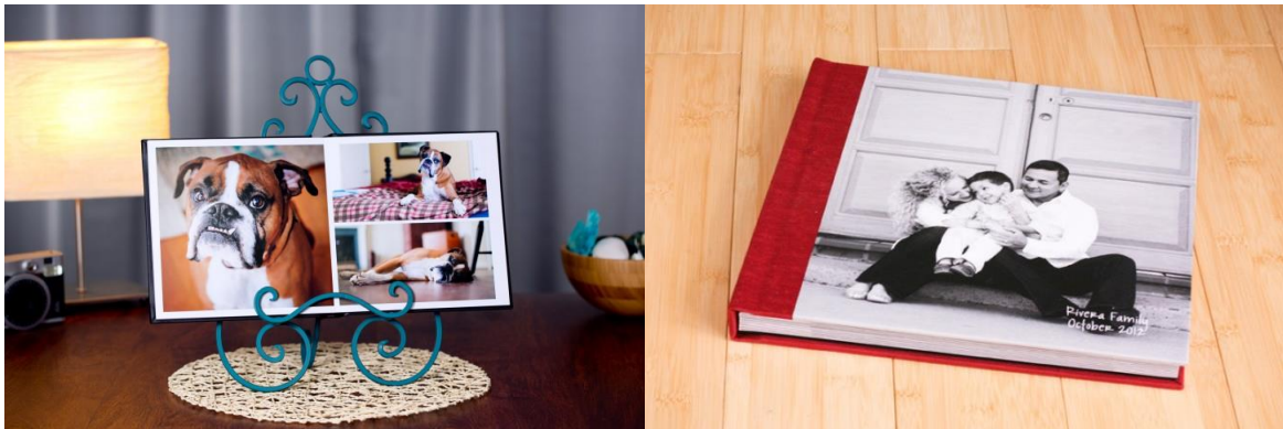
Options: Photo Covers, Fabric Covers, Fashion Covers (right)